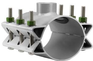
JCM 478 - Available in Stainless Steel (304 or 316)